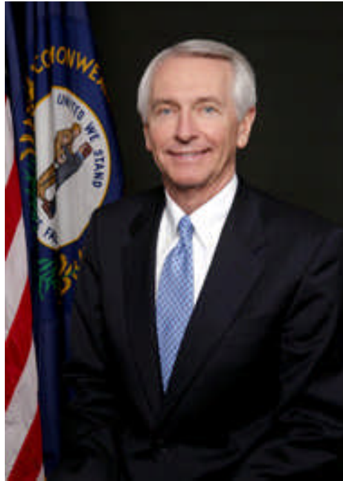
Steve Beshear Governor of the Commonwealth of Kentucky